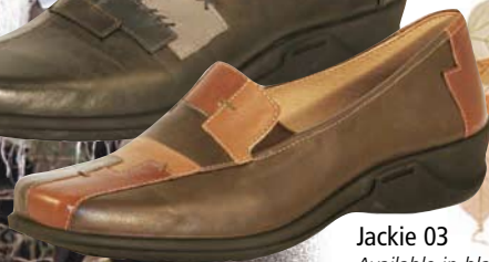
Jackie 03 Available in black, brown & bronze

Autumn/Winter 2008 Collection of Fashionable Footwear