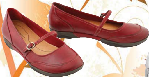
Silorra ~ Red