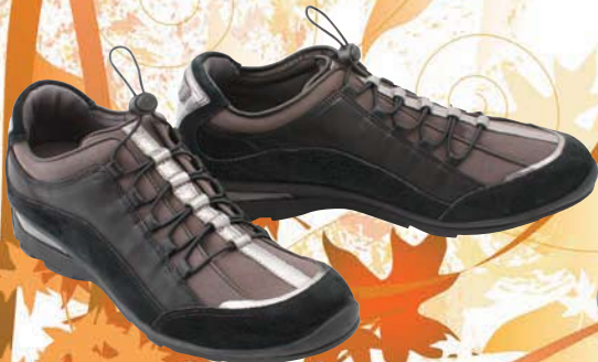
Royalston ~ Black