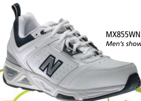
MX855WN Men's shown.