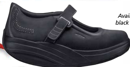
Kaya Available in black & navy