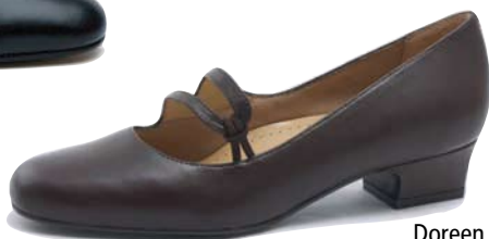
Doreen Available in black, mocha & navy