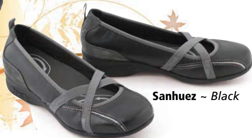
Sanhuez ~ Black