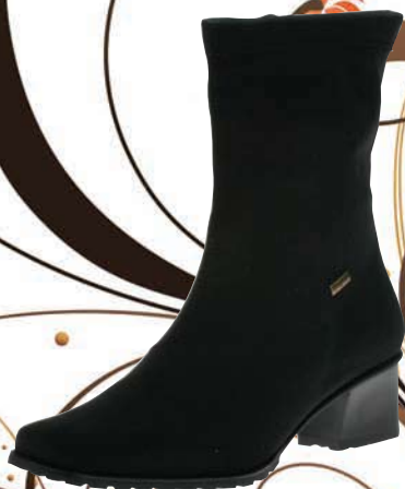
Paris Available in a tall boot