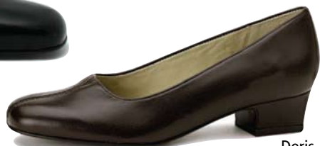
Doris Available in black & mocha