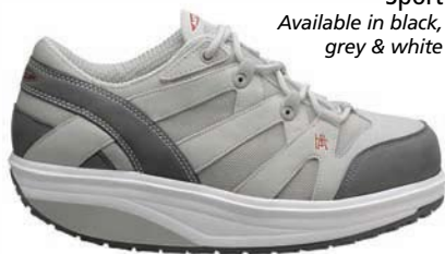
Sport Available in black, grey & white