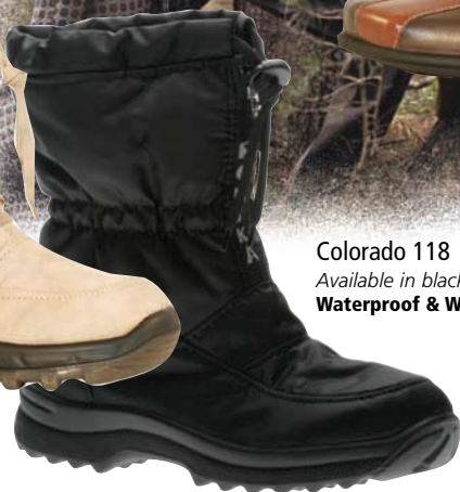
Colorado 118 Available in black. Waterproof & Washable