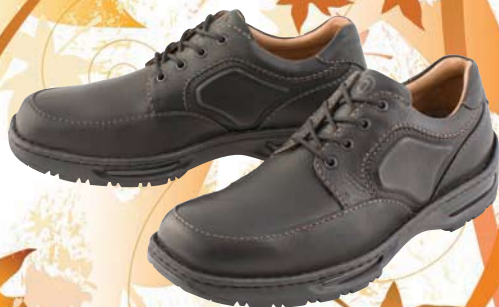
Westgrove ~ Black