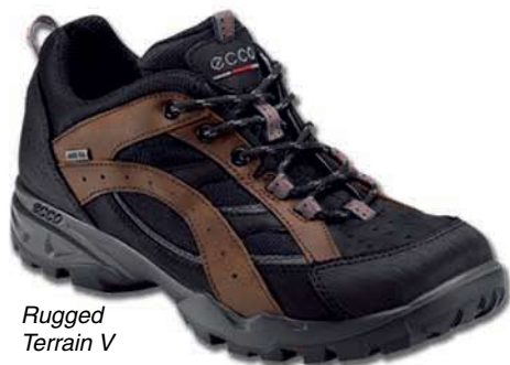
Rugged Terrain V