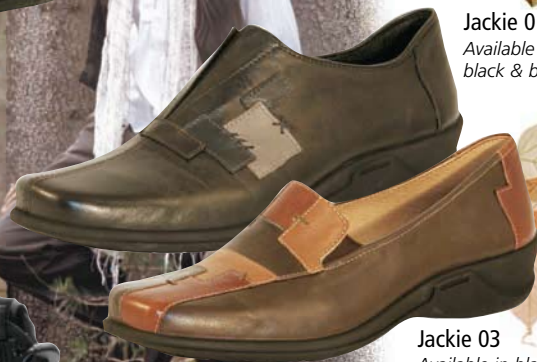
Jackie 01 Available in black & brown