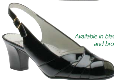
Verona Available in black patent and brown multi