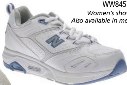
WW845WB Women's shown. Also available in men's.