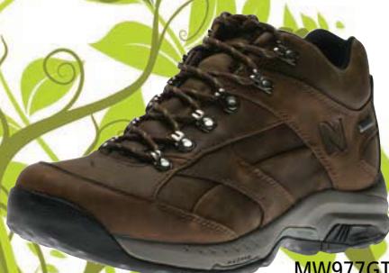
MW977GT Men's shown.