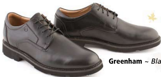
Greenham ~ Black

Elegant design, rich leathers, and advanced performance technology blend timeless style with comfort that lasts.