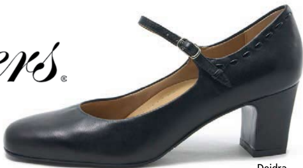
Deidra Available in black & white pearl