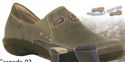
Granada 03 Available in black, brown & wine

Available in select Walking on a Cloud Locations