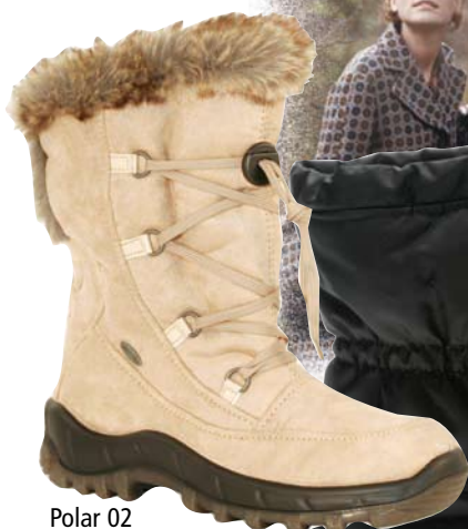
Polar 02 Available in black, beige & white Waterproof & Washable