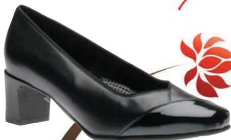
Verona Available as shown