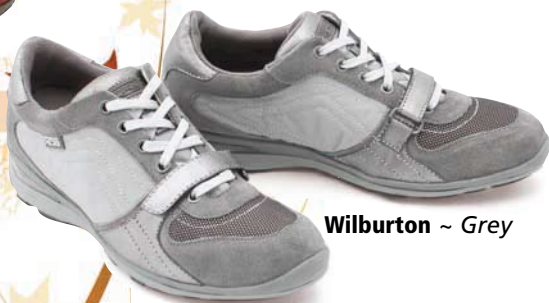
Wilburton ~ Grey

A contemporary look, durable materials, and sturdy construction add up to XCS. It's how metropolitan cool flexes its muscles.