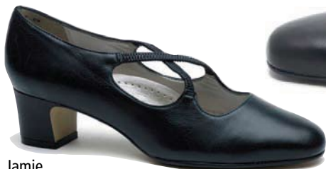
Jamie Available in black, navy, white pearl