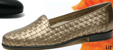
Liz Available in black, brown, navy, light tan, bone, pewter, pearl, white