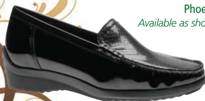
Phoenix Available as shown