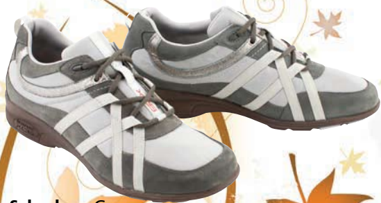
Sabeeke ~ Grey