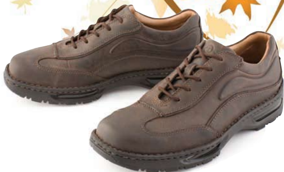
Engleside ~ Brown

* This style is from the Rockport collection