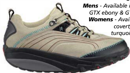
Chappa Mens - Available in navy, GTX ebony & GTX rock Womens - Available in covert, stone, turquoise blue

We're anti-shoe. We're anti-boot. We're anti-sandal. And we're definitely anti-flip flop. In fact, we're anti anything that doesn't defend your back against the corrosive power of hard, flat surfaces. We're anti anything that doesn't improve your posture. We're anti anything that doesn't protect your knees or tone your muscles just by standing there. Actually, we're anti anything that doesn't change your life for the better. But something you can wear on your feet that can do all of that? Now that we can get behind.