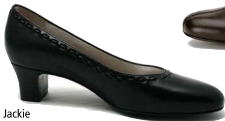
Jackie Available as shown