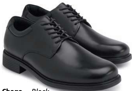
Chaga ~ Black

* This style is from the Rockport collection