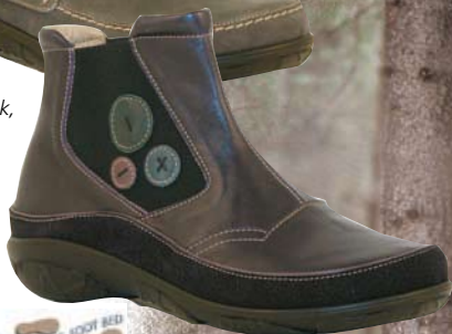
Granada 06 Available in black & brown