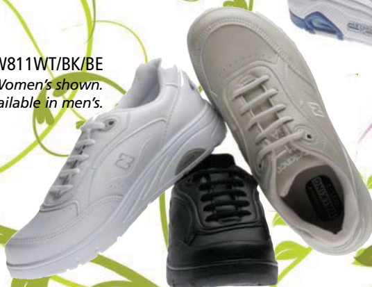
WW811WT/BK/BE Women's shown. Also available in men's.