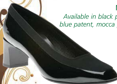
Milano Available in black patent, blue patent, mocca patent