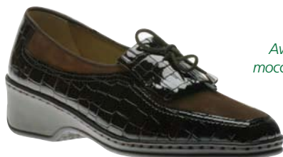
Reggio Available in mocca & black