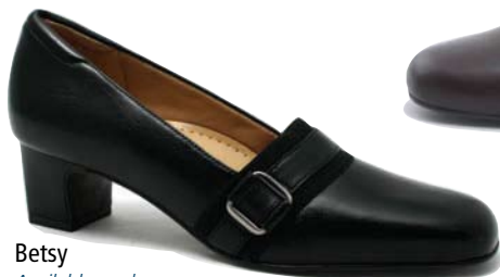
Betsy Available as shown