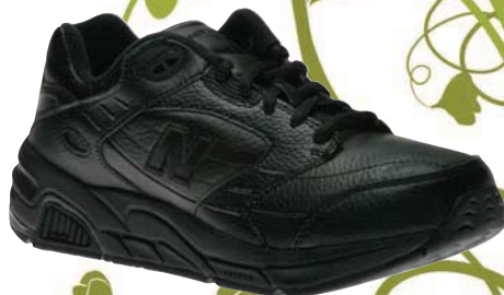
WW926BK Women's shown