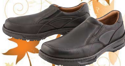
Eastbourne ~ Black